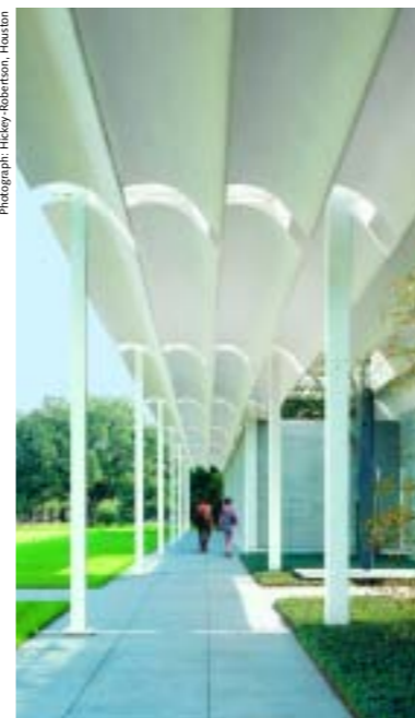
North promenade with Michael Heizer, Charmstone , 1991 (right)

In keeping with the egalitarian beliefs of its founding patrons, the Menil charges no admission fee. Through their support, Menil members and other generous donors help ensure that the museum remains open free of charge.