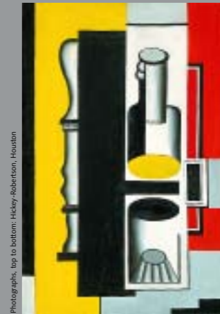
Fernand Léger, Nature Morte (Still Life) , 1927 Oil on canvas, 36 1/8 x 23 1/2 inches