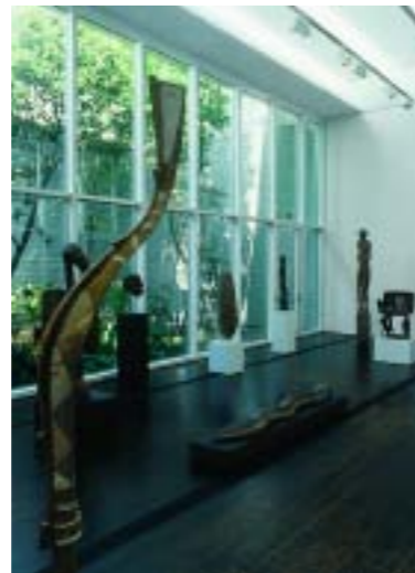
African art gallery and north atrium