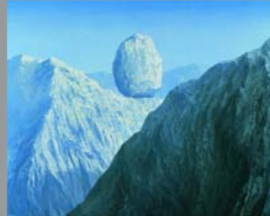
René Magritte, La clef de verre ( The Glass Key ), 1959 Oil on canvas, 51 1/8 x 63 3/4 inches

© 1999 C. Herscovici, Brussels. Photograph: Hickey-Robertson, Houston