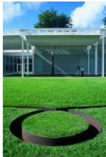
North facade and entrance with Michael Heizer, Isolated Mass/Circumflex (#2) , 1968–78 (detail, foreground)