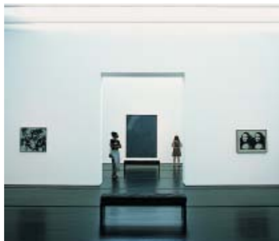
Twentieth-century art galleries with Andy Warhol, Little Race Riot , 1964; Jasper Johns, Voice , 1964–67; and Warhol, Double Mona Lisa , 1963 (left to right)