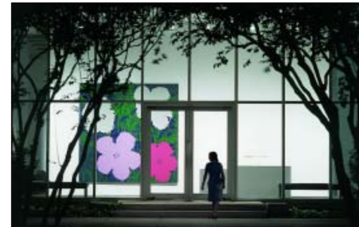
South entrance with Andy Warhol, Flowers , 1966